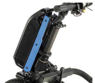
Colour-kit (sidebars) included in delivery (accent colour blue)