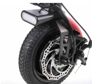
LED-light, Fender (accent colour red) and disc-brake (pictured on EMF070085 Drive wheel 8,5", solid tyre)