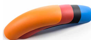
Colour-kit (mudguard) included in delivery